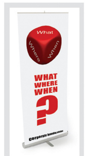
Corporate Pull Ups

Call us for your promotional needs we may surprise you