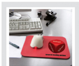
Corporate Mouse Mat